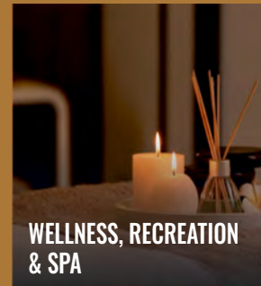
WELLNESS, RECREATION & SPA