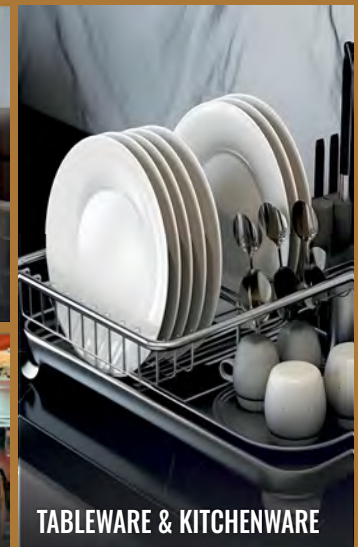
TABLEWARE & KITCHENWARE