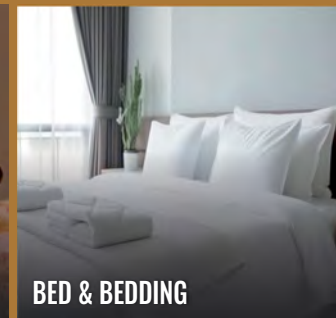
BED & BEDDING