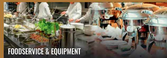
FOODSERVICE & EQUIPMENT