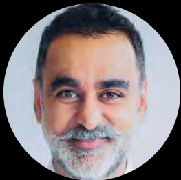
Vineet Bhatia Michelin Starred Chef

“I think it's a great event to have. Platforms like these showcase Indian Hospitality at its finest. This is, by far, the largest expo of this kind. Beautiful products, great for sourcing, and great for networking too! I am honoured to be here.”