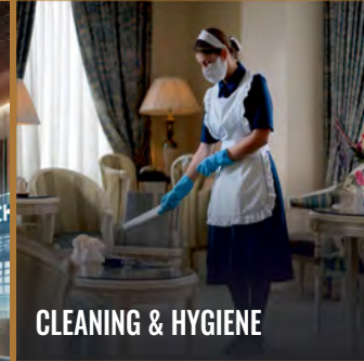
CLEANING & HYGIENE